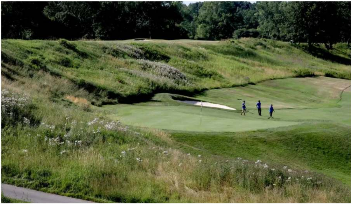
Grounds crew work on the greens at Plum Hollow Country Club in Southfield on Tuesday, July 19, 2022.