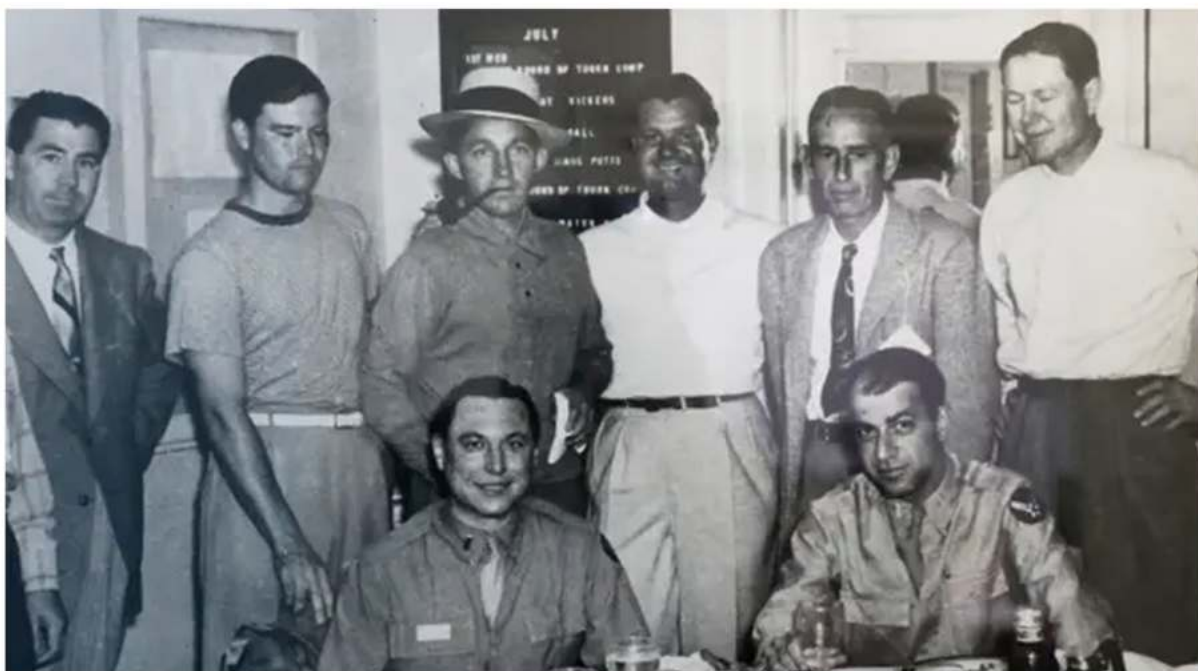
Golfers including Byron Nelson, Bing Crosby and Joe DiMaggio at Plum Hollow Country Club in Southfield during the 1943 Red Cross tournament.