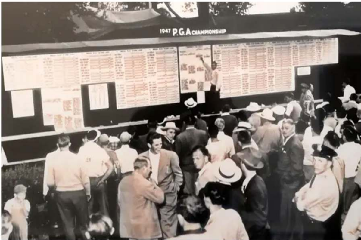
People gather around the scoreboard of the 1947 PGA Championship at Plum Hollow Country Club in Southfield. The private golf course that opened in 1921 went under a renovation recently. It held the PGA Championship in 1947 and an unofficial 1943 "Ryder Cup" exhibition during World War Two of some top American players.