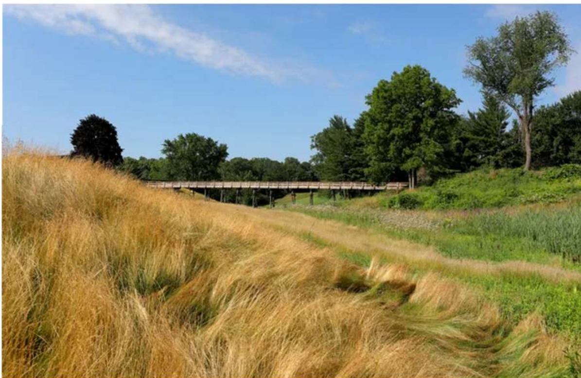
Heather grass grows on a hill at Plum Hollow Country Club in Southfield on Tuesday, July 19, 2022.