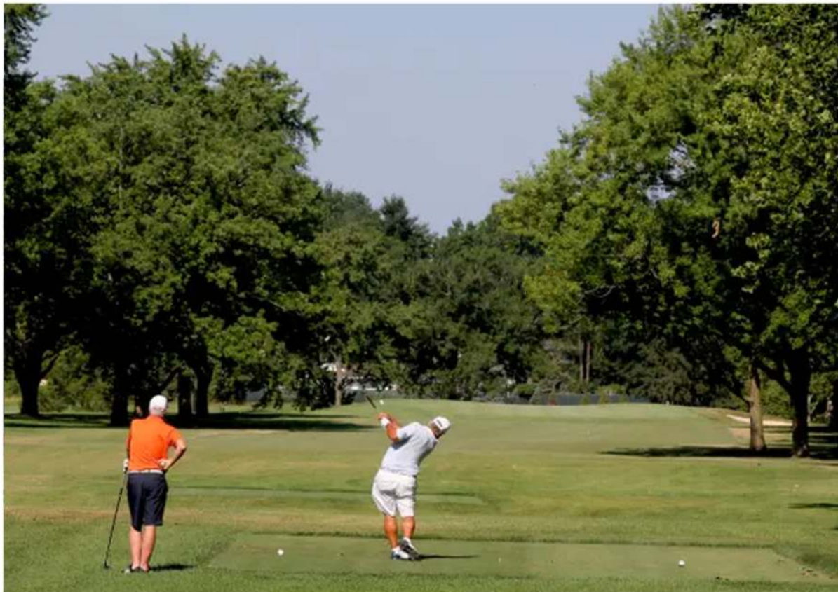
Golfers tee off at the par-4 fourth hole at the Plum Hollow Country Club in Southfield on Tuesday, July 19, 2022.