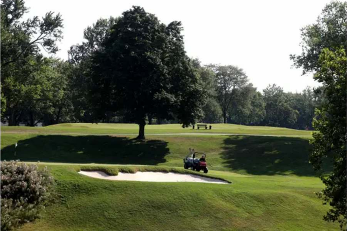
A fertilizer cart makes its way across the greens during groundskeeping work at Plum Hollow Country Club in Southfield on Tuesday, July 19, 2022.