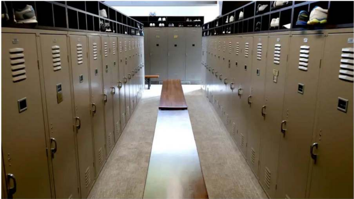
The men's locker room at Plum Hollow Country Club in Southfield on Tuesday, July 19, 2022.