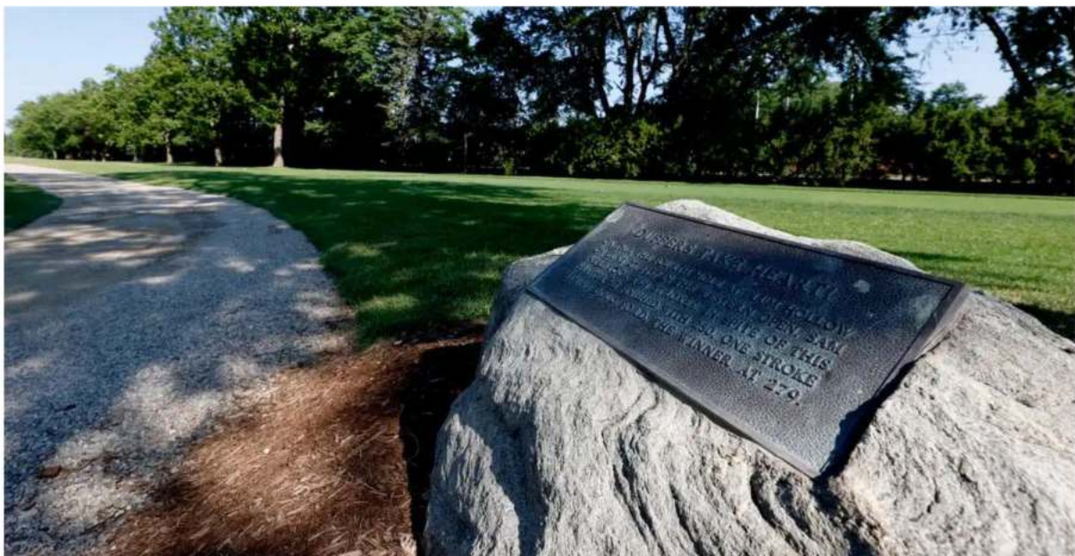
What's referred to as Snead Rock at the par-4 fourth tee at the Plum Hollow Country Club in Southfield on Tuesday, July 19, 2022. On June 27, 1957 in the Western Open, Hall of Fame golfer Sam Snead took 10 strokes at this hole and lost the tournament by one shot to Doug Ford.