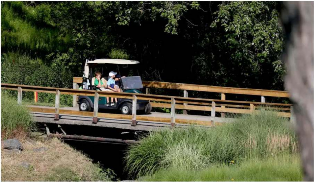
A golf cart goes over one of the rebuilt bridges at Plum Hollow Country Club in Southfield on Tuesday, July 19, 2022.