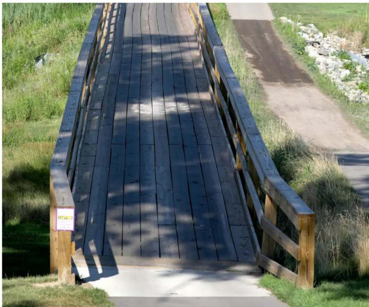
The bridge leading to the five green near 9 Mile Road at Plum Hollow Country Club in Southfield on Tuesday, July 19, 2022.