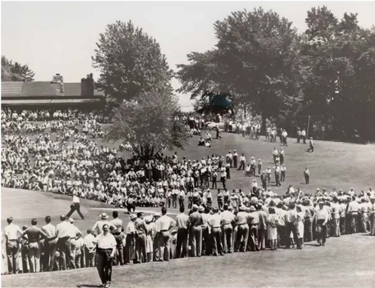
The 18th green during the 1947 PGA Championship at Plum Hollow Country Club in Southfield.