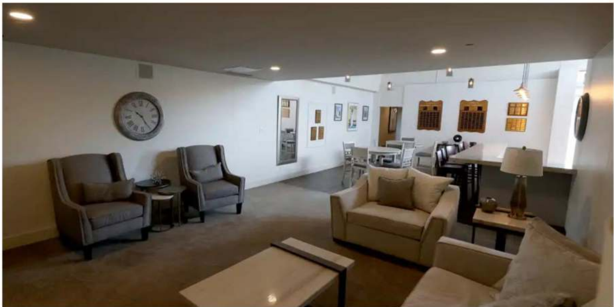
The sitting area leading to the ladies locker room at Plum Hollow Country Club in Southfield on Tuesday, July 19, 2022.