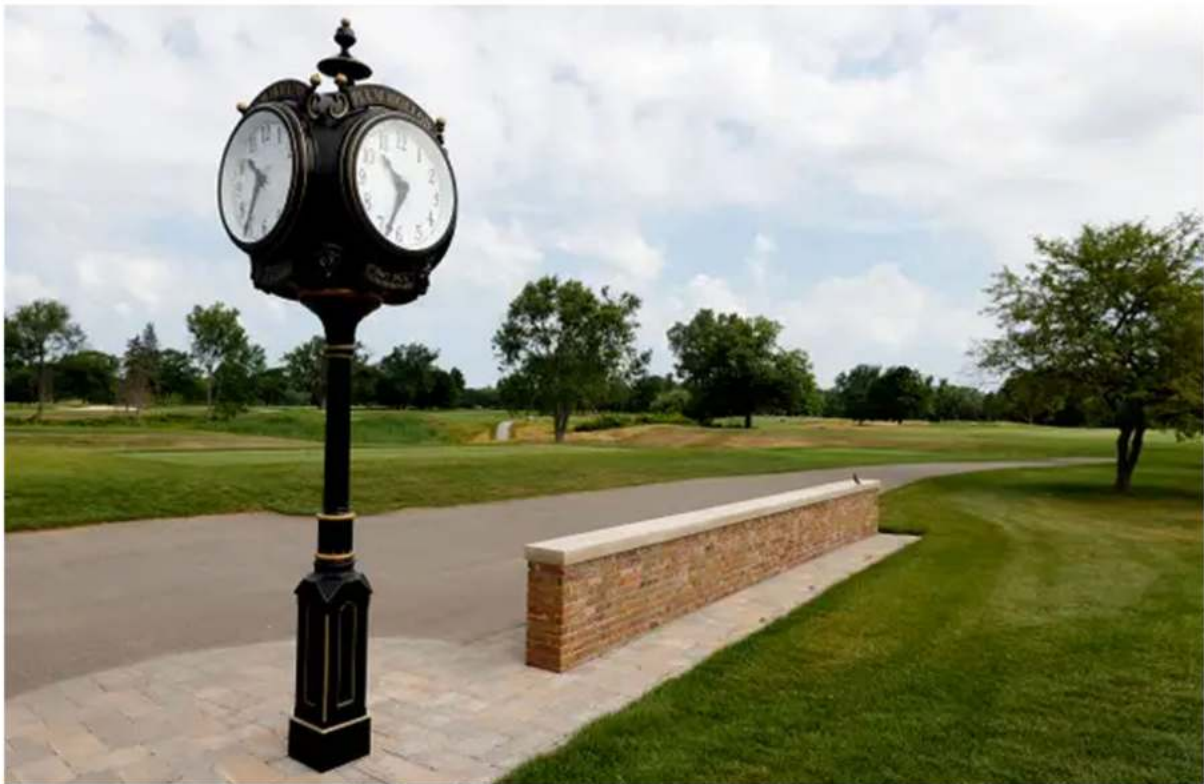
The presidents clock near the putting green at Plum Hollow Country Club in Southfield on Tuesday, July 19, 2022.