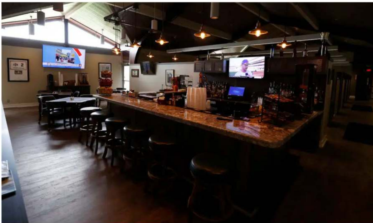
The newly remodeled bar area next to the mens locker room at Plum Hollow Country Club in Southfield on Tuesday, July 19, 2022.