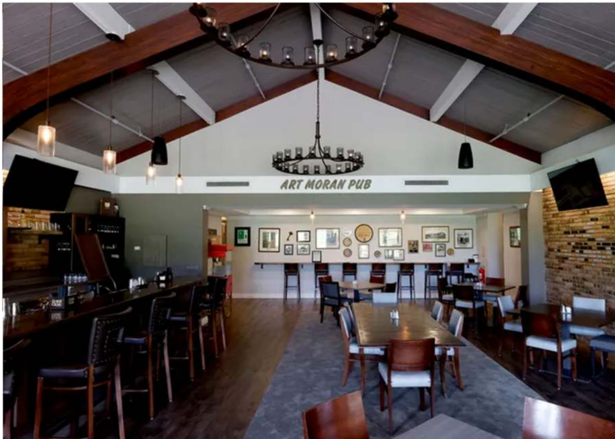
The Art Moran Pub near the men's locker room at Plum Hollow Country Club in Southfield on Tuesday, July 19, 2022.