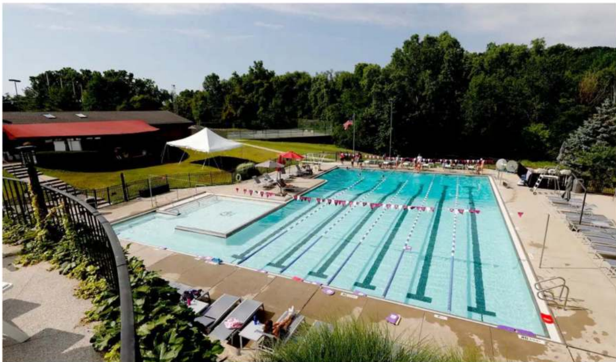
The pool area at Plum Hollow Country Club in Southfield on Tuesday, July 19, 2022.